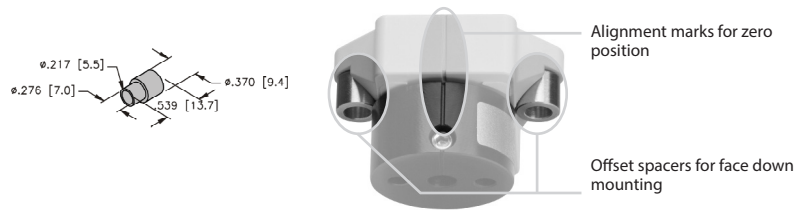
Spacer sleeve for overhead mounting